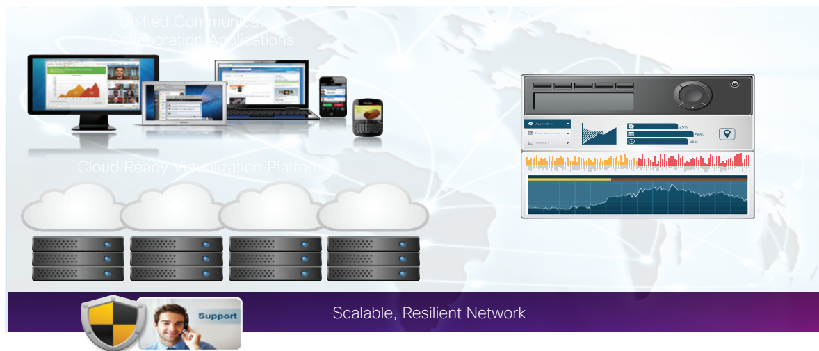
Figure 1. Cisco Hosted Collaboration Solution

Cisco’s market-leading collaboration applications are delivered within a highly secure, cloud-ready, virtualized platform that is made available on a scalable and resilient network. The entire environment is managed through a centralized management system that provides fulfillment and assurance capabilities as well as billing mediation, with role-based access control for delegated administration.